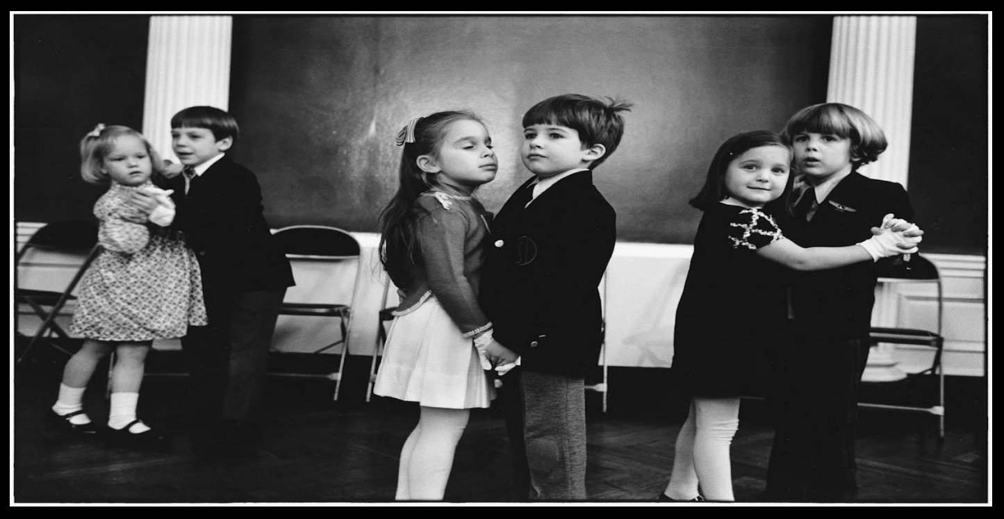
10% DISCOUNT FOR EXISTING STUDENTS